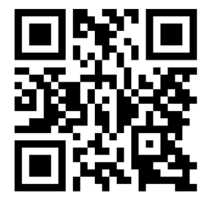
Video user guide for service kit, Premium-PLUS regulator with production date the 15<sup>th</sup> January 2020 and after. (See above)